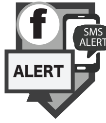
ELECTRONIC MASS ALERTS SYSTEM