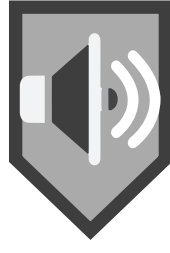
INDOOR & OUTDOOR SPEAKERS